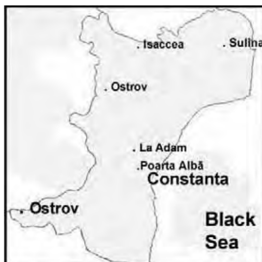
Figure 1. Mammuthus primigenius localities in Dobrogea Figura 1. Localități cu Mammuthus primigenius în Dobrogea

In these circumstances, in southwest Romania the woolly mammoth remains extremely poor documented (APOSTOL, 1962; 1968). However, a recent mammoth finding on the right Danube bank at Ostrov (Constanta district), adds a new locality for this species in Dobrogea (Fig. 1).