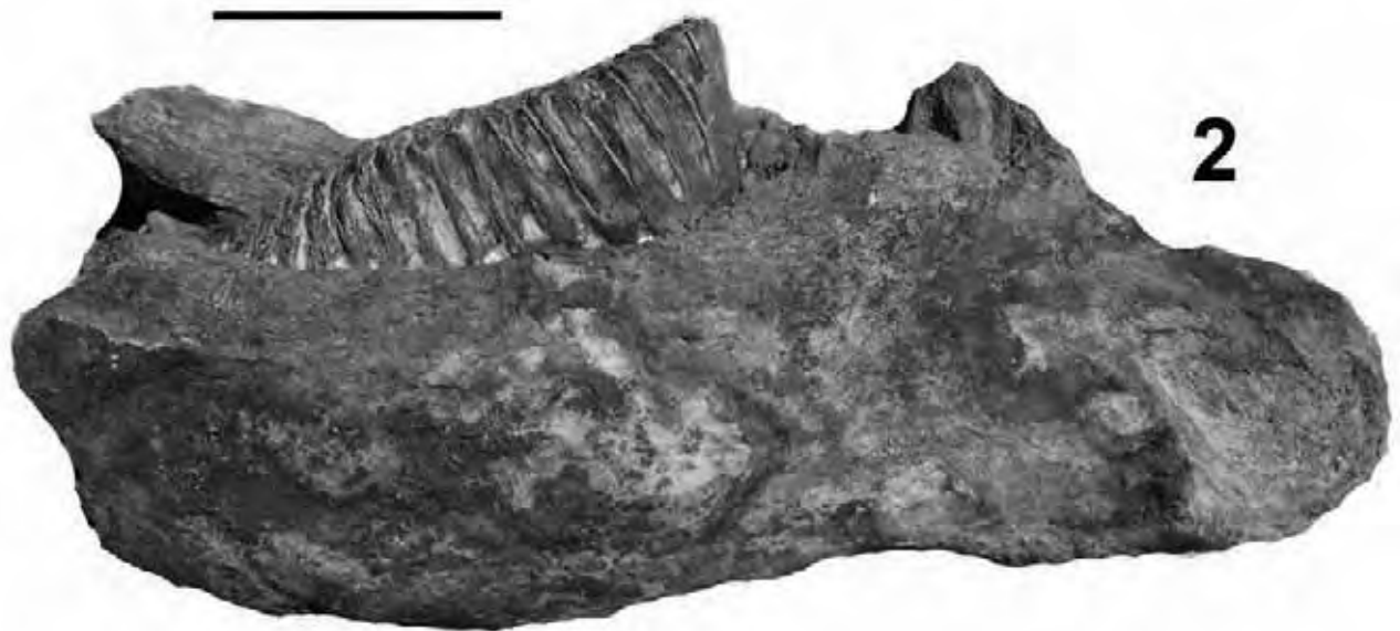
Plate I, figs. 1-2