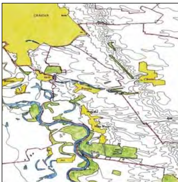
Figure 1. Location of the Lacustrine Complex within the area (according to CIOBOIU, 2002). Figura 1. Localizarea Complexului lacustru în zonă (după CIOBOIU, 2002).

the streams located in the spring area for the analysis of the main physical-chemical indicators and the correlation of the results with the fish populations present in the basins.