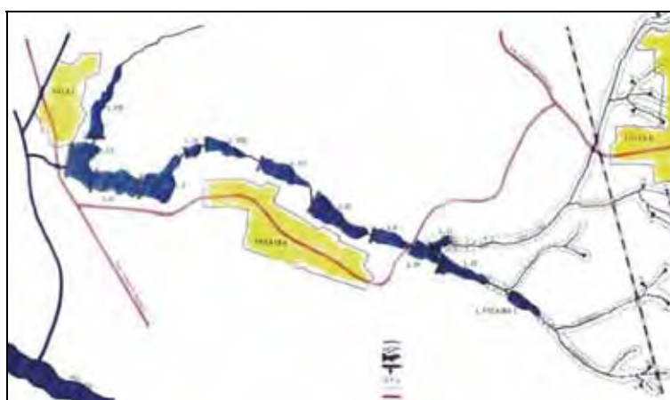
Figure 2. Sketch of the Preajba Valley lacustrine complex from the Oltenia Plain (according to CIOBOIU, 2002). Figura 2. Schița complexului lacustru Valea Preajba din Câmpia Olteniei (după CIOBOIU, 2002).