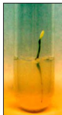
Figure 7. Seedling (type F). Figura 7. Puiet (tipul F).