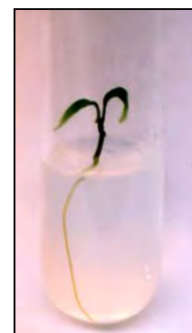
Figure 8. Seedling (type G). Figura 8. Puiet (tipul G).

F - normal hypocotyl and root, but the cotyledons with embryonic morphology (not enlarged) (Fig. 7)