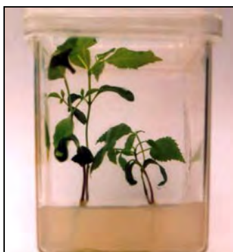
Figure 6. Normal seedlings (type E). Figura 6. Puiet normal (tipul E).