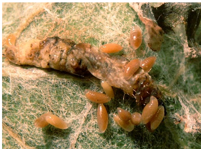
Figure 1. The mature larvae of Colpoclypeus florus near the remains of Sparganothis pilleriana caterpillar (original).

In accordance with our observations, the larvae of C. florus that were just hatched migrate along the body of the host, where they feed ectoparasite, so that, when their length is about 3 mm, the host is killed (Fig. 1).