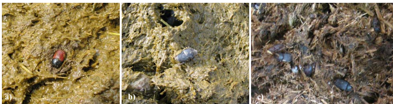
Figure 1. Scarabeoid species collected in the floodplain of the Siret River area (June, 2007).

According to the data presented in Table 1, on the dung exposed for less than twenty-four hours, the number of species and specimens is reduced. For example, in the first sample, the author found 2 specimens of Aphodius fimetarius (LINNAEUS 1758) (Fig. 1a); for the second sample (the dung that was exposed for four hours), it was identified a number of 6 species – in this case Onthophagus taurus (SCHREBER 1759) (Fig. 1b) was the dominant species (9 specimens – 56.25%). In the next four samples (the faeces that were exposed for six, eight, ten and respectively twenty four hours), the density of scarabeoid beetles was low: three, six, four, and respectively two specimens.