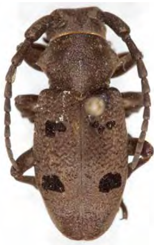
Figure 4. Herophila tristis .