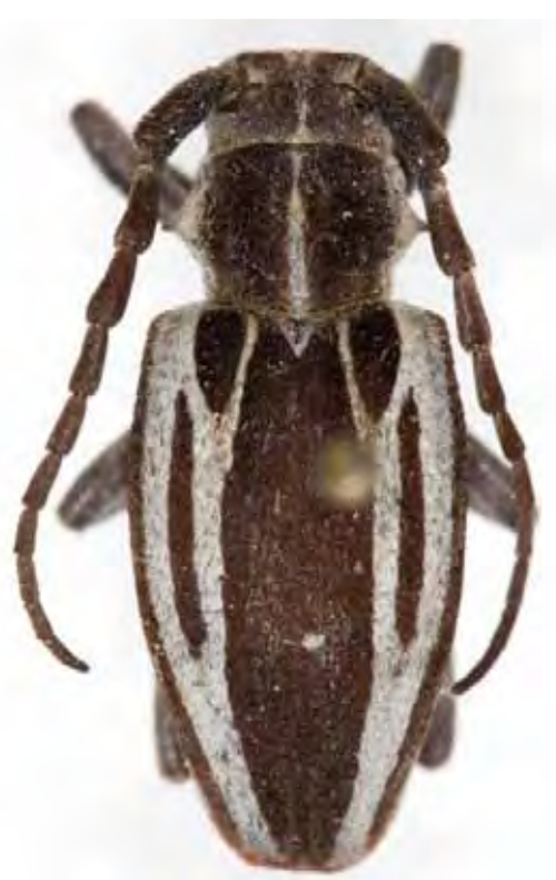
Figure 5. Neodorcadion exornatum .