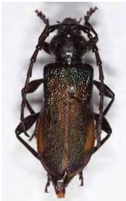
Figure 2. Ropalopus insubricus .