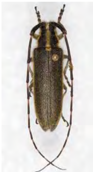
Figure 1. Agapanthia cynarae .