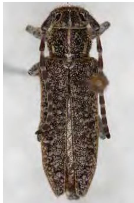
Figure 3. Pilemia tigrina .