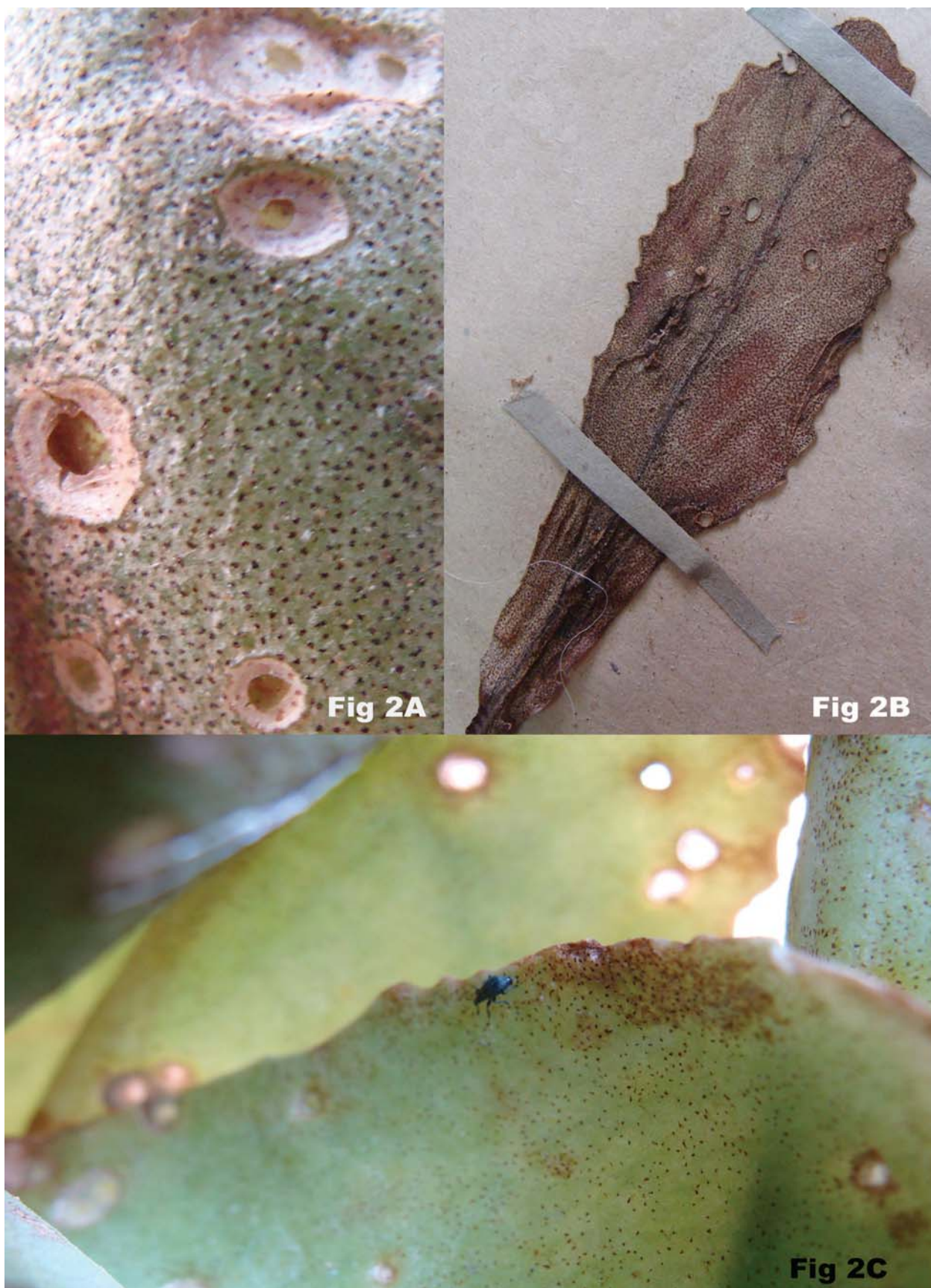
Figure 2. Aspect of nonperforating lesions produced by Aizobius sedi to Sedum telephium L. infested “in vivo” – 2A; in herbarium specimens - 2B, and also of perforating lesions together with the weevil – 2C.