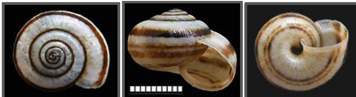
Figure 4. The view of Xeropicta krynickii from three directions (Scale 10 mm). Figura 4. Vedere Xeropicta krynickii din trei direcții (Scala 10 mm) (original).