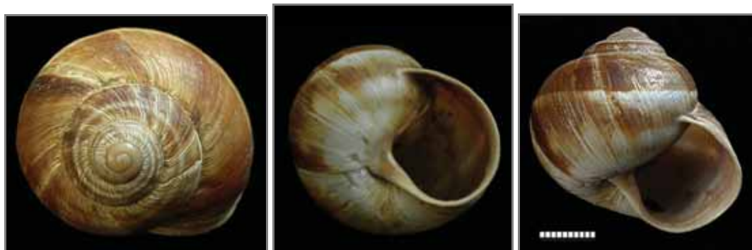
Figure 8. The view of Helix (H.) lucorum from three directions (Scale 10 mm). Figura 8. Vedere Helix (H.) lucorum din trei direcții (Scala 10 mm) (original).

Mustafa Öztop M. Akif Ersoy University, İstiklal Campus, 15030, Burdur – Turkey, E-mail: mustafa_904409@yahoo.com