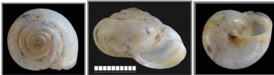
Figure 3. The view of Monacha (Metatheba) samsunensis from three directions (Scale 10 mm). Figura 3. Vedere Monacha (Metatheba) samsunensis din trei direcții (Scala 10 mm) (original).