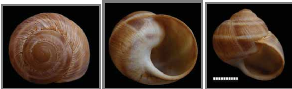
Figure 7. The view of Helix (Pelasga) pathetica from three directions (Scale 10 mm). Figura 7. Vedere Helix (Pelasga) pathetica din trei direcții (Scala 10 mm) (original).