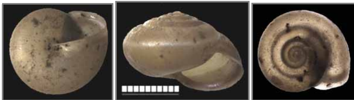
Figure 2. The view of Monacha (M.) melitenensis from three directions (Scale 10 mm). Figura 2. Vedere Monacha (M.) melitenensis din trei direcții (Scala 10 mm) (original).