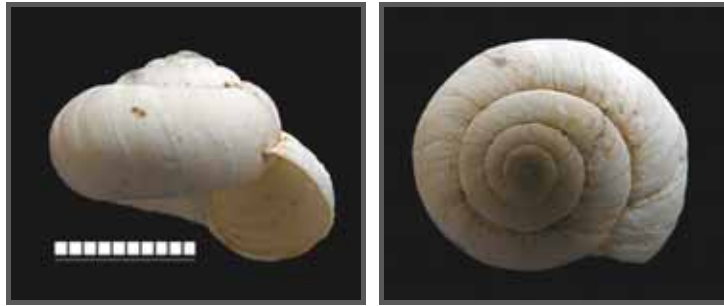
Figure 5. The view of Xeropicta derbentina from two directions (Scale 10 mm). Figura 5. Vedere Xeropicta derbentina din două direcții (Scala 10 mm) (original).