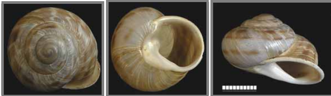
Figure 6. The view of Assyriella guttata from three directions (Scale 10 mm). Figura 6. Vedere Assyriella guttata din trei direcții (Scala 10 mm) (original).