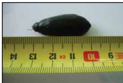
Figure 5. The body length in C. lateralimarginalis ♂. / Figura 5. Lungimea corpului la C. lateralimarginalis ♂ (original).