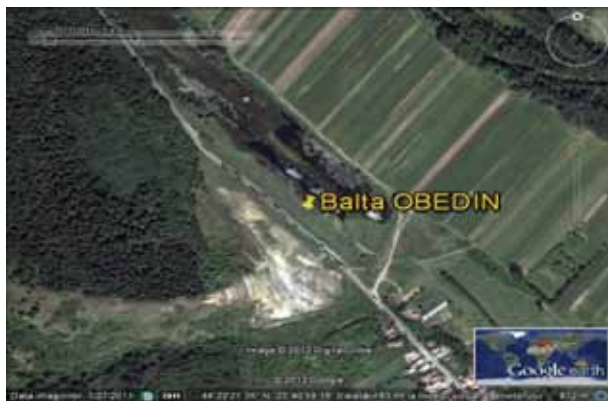
Figure 1. Obedin Pond (Google Earth). / Figura 1. Balta Obedin (Google Earth).