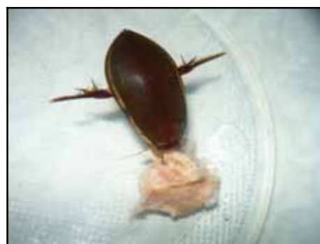
Figure 6. C. lateralimarginalis feeding on pig sausages. / Figura 6. C. lateralimarginalis hrănindu-se cu o bucată de cârnaț de porc (original).