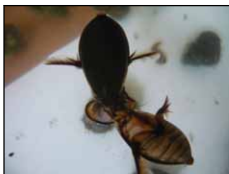
Figure 5. C. lateralimarginalis feeding on snails, Viviparus sp. / Figura 5. C. lateralimarginalis hrănindu-se cu melc acvatic ( Viviparus sp.) (original).

In terms of food regime, beetles have consumed both aquatic ( Lymanea stagnalis , Cepaea sp., Viviparus sp.) and terrestrial snails ( Helix pomatia ) (Fig. 5). Interestingly, although the species Helix pomatia is not an aquatic species, it represented the food for C. lateralimarginalis for a week. During four days, C. lateralimarginalis was fed on pieces of pork sausages and they accepted it without any problem (Fig. 6).