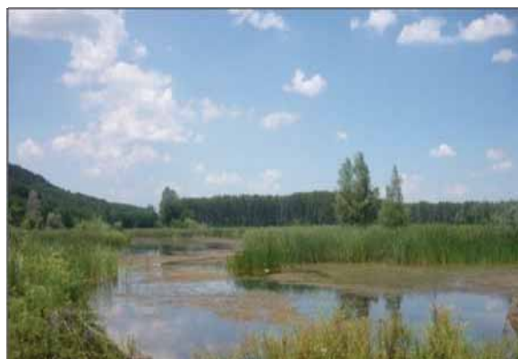
Figure 2. Obedin Pond. / Figura 2. Balta Obedin (original).

The first work of synthesis on the family that centralized Dytiscide references in the literature and data processing the heritage preserved in the Department of Natural Sciences Museum of Oltenia Craiova MOGOȘEANU was published (2010). The Heritage Section of Natural Sciences identified 25 specimens that were collected between 1951 and 2001 from five collecting sites in Dolj County – Bistreț, Ciuperceni, Craiova, Desa and Rast.