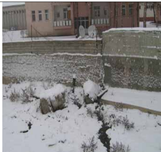
Photo 2. Discharge pipe of domestic wastewater in the Murat River (image taken in Ağrı city). / Foto 2. Deschiderea conductei cu ape menajere în râul Murat (fotografie realizată în oraşul Ağrı) (original).