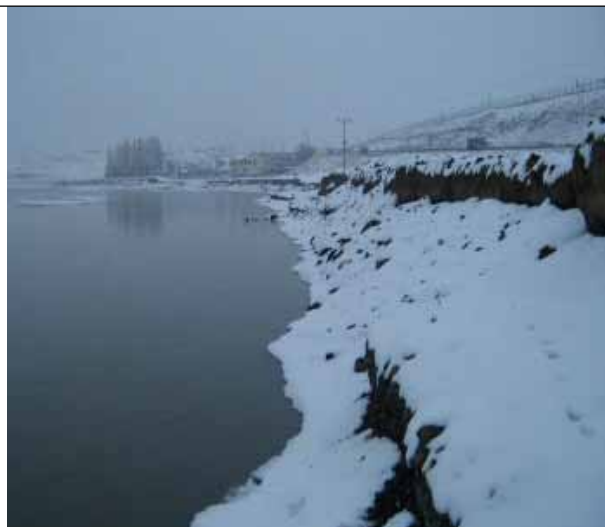
Photo 1. The Murat River – the sewerage system discharges directly into the river. / Foto 1. Râul Murat – sistemul de canalizare deversează direct în râu (original).