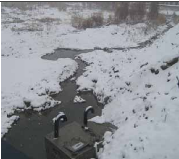
Photo 3. Discharge of wastewater in the Murat River (image taken in Ağrı city). / Foto 3. Deversarea apei uzate în Râul Murat (imagine realizată în oraşul Ağrı) (original).