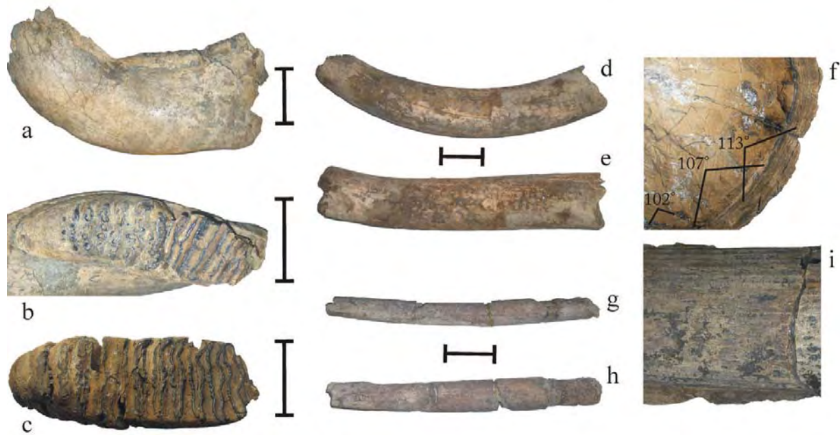
Figure 1. Proboscidean dentognathic remains from Copăceni. a - b. NMG1, right hemi-mandible bearing the M_2 and M_3 , in buccal and occlusal views; c. ISER Co-P01, left M_3 , in occlusal view; d - e. NMG2, left I^1 , in lateral and dorsal views; f. cross section of NMG2, showing selected measurements of outer Schreger angles; g - h. NMG19, juvenile I^1 , in side and dorsal views; i. ventral view of NMG19, showing the fluted outer surface of the dentine layer. Anterior is to the right for a-c and to the left for d-e and g-i. Scale bars: 10 cm.

The M_3 s are not fully developed and with only seven plates in wear (Fig. 1b) the erupted parts are not extensively worn. None of the worn plates have the enamel crests continuous across the entire width of the molar. The wear figures range from subcircular islets (in the posterior plates) to larger more complicated closed loops, in which the enamel is moderately folded (in the anterior plates). The broken posterior part of the left horizontal branch allows the observation of the plates that had not erupted yet, which raises the total number of observable plates of the molar to 11. The parameters measured for the molars described above are consistent to those mentioned for M. meridionalis by MAGLIO (1973). They are wider and lower than the molars of E. antiquus and do not show the “dot-dash-dot” anti-quad wear figure.