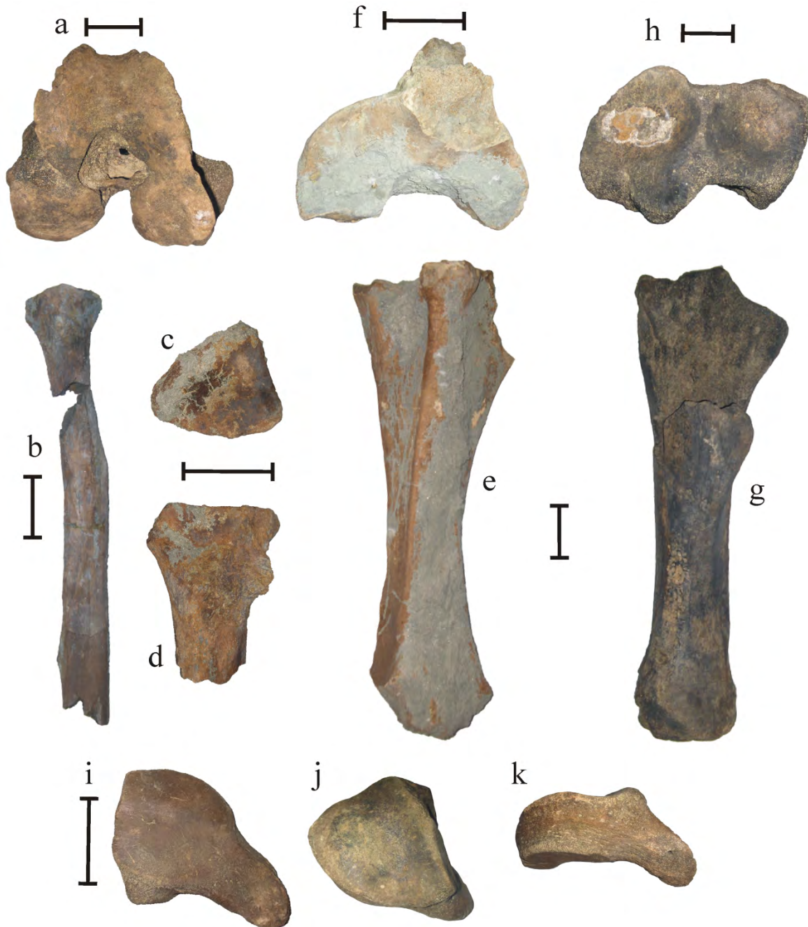
Figure 3. Proboscidean limb bones from Copăceni. a. NMG7, right femur, in distal view. b - d. NMG9, left radius, in anterior, proximal, and posterior views. The bulge on the posterior side near the proximal end detailed in d represents the fusion area between the radius and ulna. e - f. NMG20, left ulna, in medial and proximal views; g - h. NMG6, left tibia, in anterior and proximal views; i - k. NMG12, left pyramidal, in proximal, distal, and anterior views. Scale bars: 10 cm.

A left pyramidal, NMG12 (Figs. 3i - 3k), is the least damaged and best preserved of all postcranial elements discovered so far. All articulation facets are fused to the bone, evidence it belonged to an adult. In proximal view, the bone has a triangular outline, which includes the concave and flat ulnar articulation facet and the characteristic medio-proximal beak-like process. The distal facet resembles a rounded triangle, and serves for the articulation with the unciform and the 5 th metacarpal. The lateral side is subrectangular, with an antero-posterior groove, below which lies the elongated and narrow articulation facet for the magnum. The pisiform articulation facet is placed on the distal part of the lateral side, where it appears as a triangular depression.