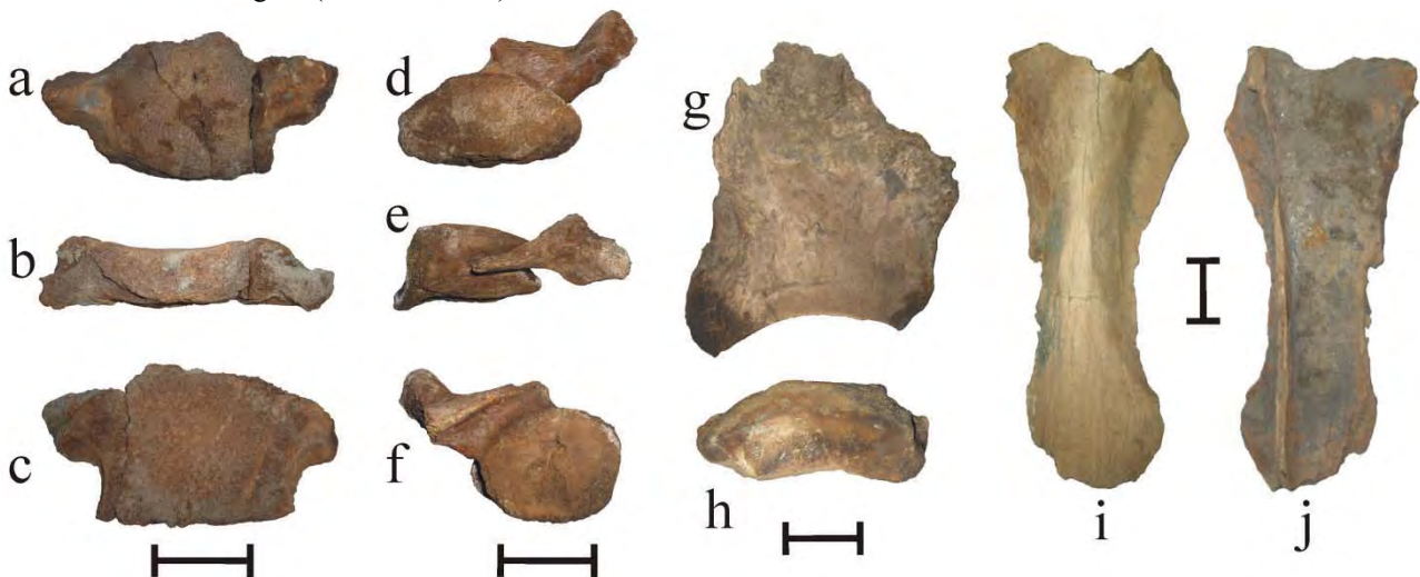
Figure 2. Proboscidean vertebra and scapula fragments from Copăceni. a - c. NMG16, cervical vertebra, in anterior, dorsal, and posterior views; d - f. NMG15, cervical vertebra, in anterior, dorso-lateral, and posterior views; g - h. NMG4, right scapula, medial and distal views; i - j. NMG11, scapula fragment, in medial and lateral views. Scale bars: 10 cm.

A single detached neural arch, which includes the neural spine, has been discovered so far (NMG13). The anterior edge of the neural spine bears an acute ridge. The right branch of the arch preserves its base, including a small part of the centrum. The same right branch bears the posterior articular facet, but this structure is covered by a hardened sediment crust. The outline of the neural arch resembles that of an equilateral triangle. The neural spine is relatively short and the neural canal relatively wide. The size and shape of the neural spine and neural canal, similar to those seen in the 7 th cervical described by MASCHENKO et al. (2011) or ATHANASSIOU (2012), hint towards a posterior position within the cervical region (5 th -7 th vertebra).