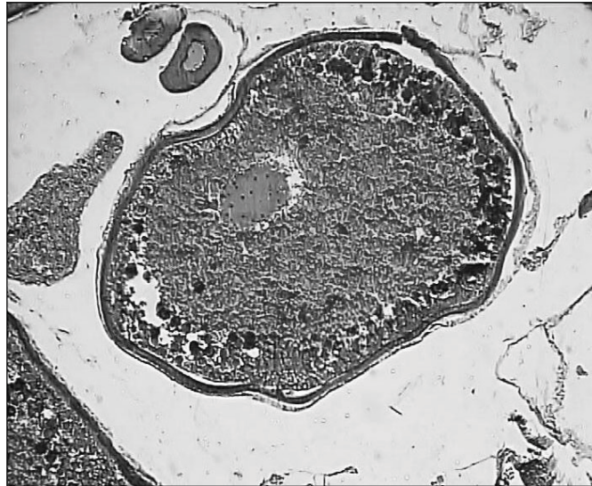
Figure 1. Resorption of oocytes in the phase of vitellogenesis beginning (original).

Gonado-somatic index (GSI) in the six-year-old females before spawning reaches 28.9%, whereas in four and five years old individuals the values of this parameter differ significantly: P < 0.95 (Table 2).