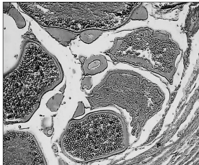
Figure 2. Swelling of membrane of oocytes of the second generation in the phase of completed vitellogenesis (original).

According to our data given in Tables 1 and 2, indicating slight differences in the values of the GSI, of the length and weight at four and five-year-old females P < 0.95 , it can be assumed that they are for the first time maturing individuals.