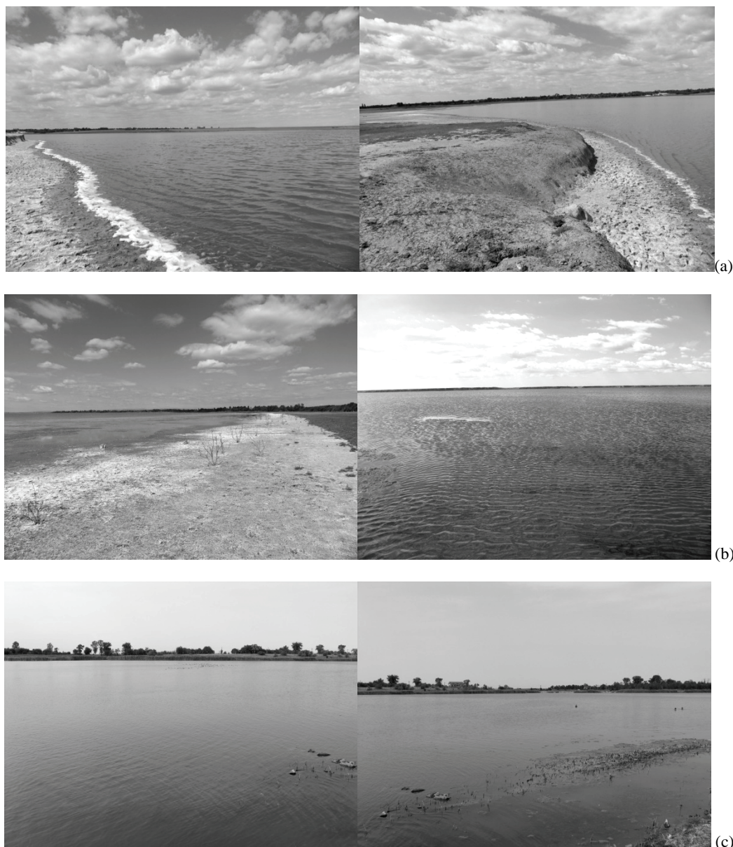
Figure 1. The physical aspect of the investigated lakes recorded in photo images using a digital camera Canon Power Shot model Pro 1: Lake Movila Miresei (a); Lake Balta Albă (b); Lake Amara – Ialomița (c) (original).

The results recorded in table 1 showed a protein content of 0.05 mg mL -1 in Ocele Mari, 0.16 mg mL -1 in Balta Albă, 0.2 mg mL -1 in Amara salt lake, and 3 mg mL -1 in the hypersaline lake Movila Miresei. The values observed for protein content are related with the absence of sodium ions (Amara and Balta Albă salt lakes – hyposaline lakes) and a low level of chloride content around 15 g L -1 . In the case of Movila Miresei and Ocele Mari (hypersaline lakes) the protein content is influenced by the presence of sodium ions and high values of chloride content - 80 and 252 g L -1 ,