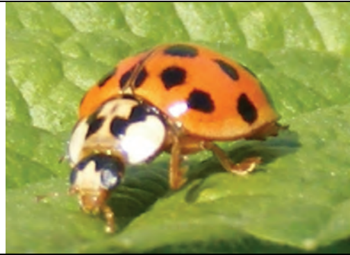
Figure 1 and 2. Harmonia axyridis on the leaves of black currant (April 23, 2011 and April 28, 2012) (original).