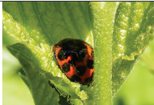
Figure 3 and 4. Harmonia axyridis on the leaves of black currant (April 23, 2015) (original).