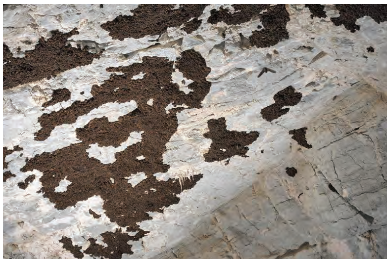
Photo 1. Pipistrellus pipistrellus / P. pygmaeus wintering colony.

Cleaning activities were undertaken in the cave that involved the removal of rubbish and items discarded by previous visitors. Defined tracks/routes for cavers’ to follow were marked along both galleries, in order to preserve the underground landscape and paleontological sites by containing traffic to discrete areas. In 2013, the flag way-markers in Speotimiș Gallery were replaced with red and white marker tape in order to more clearly define the route to be used when traversing the passage thereby protecting the adjacent areas. The gates are checked frequently and the visits by Speleologist are strictly limited during bat hibernation and nursery time (ALBUICĂ et al., 2014).