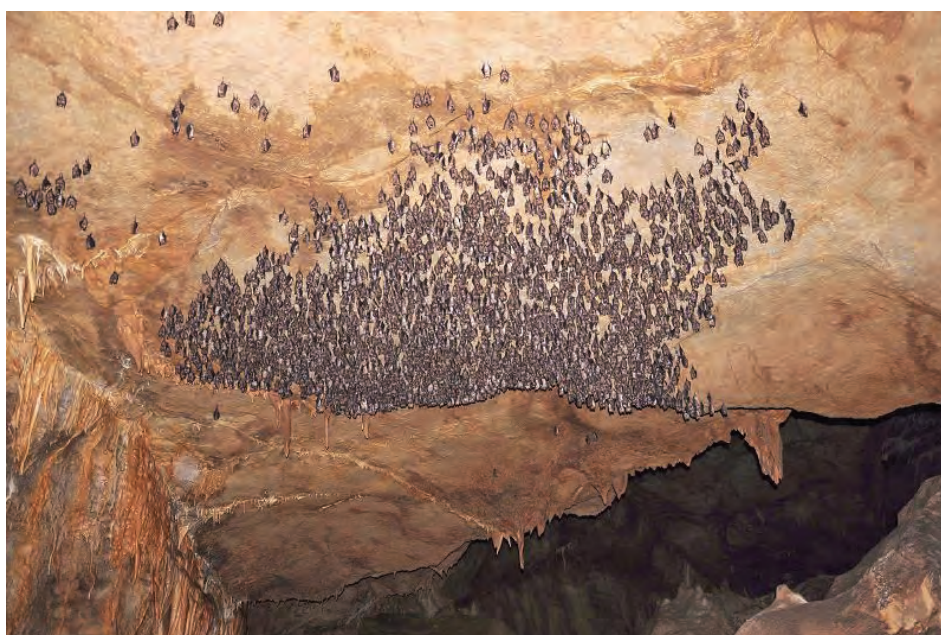
Photo 3. Rhinolophus euryale wintering colony in 2009.